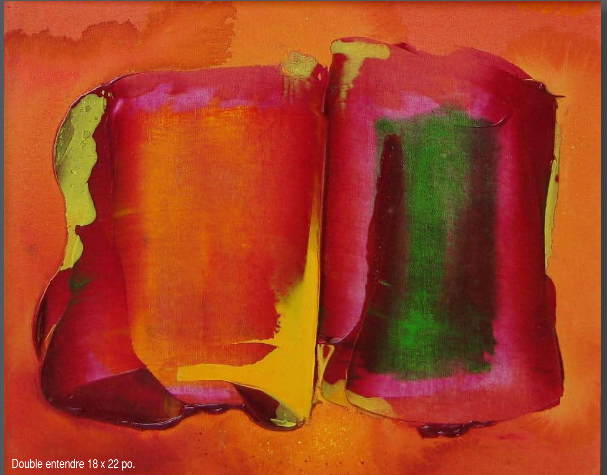
Double entendre 18 x 22 po.