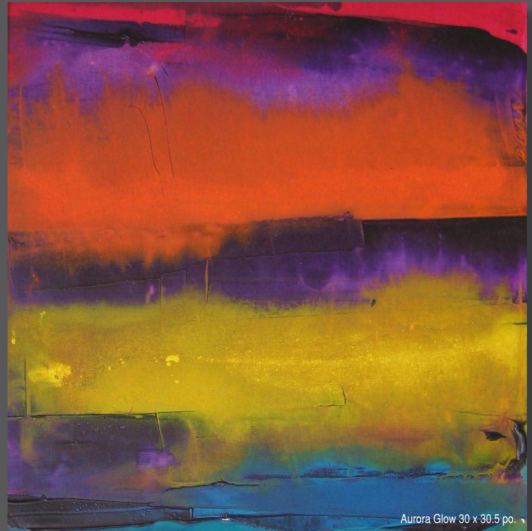
Aurora Glow 30 x 30.5 po.