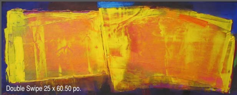
Double Swipe 25 x 60.50 po.