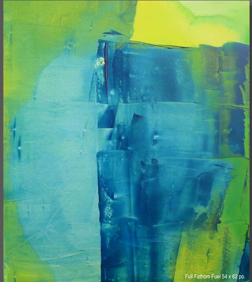
Full Fathom Fuel 54 x 62 po.