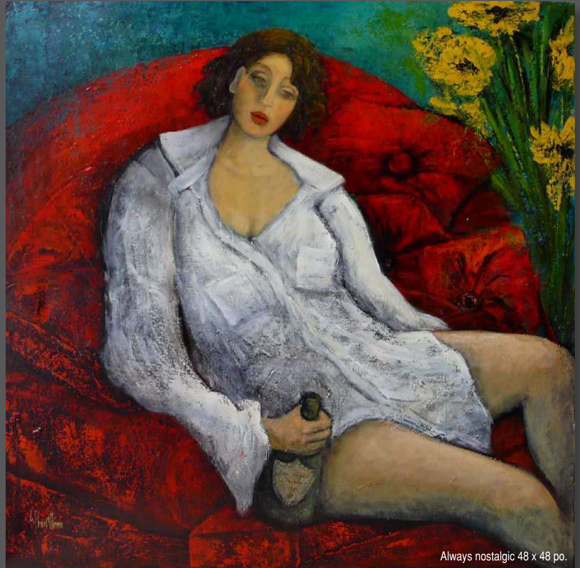
Always nostalgic 48 x 48 po.

The Gazette Montréal Métropolitain L'Express d'Outremont Magazine «Parcours-La revue des arts»