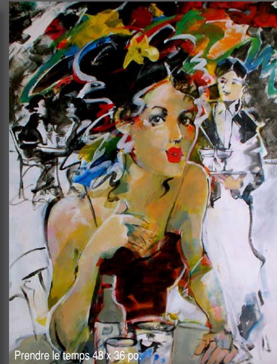
Prendre le temps 48 x 36 po.