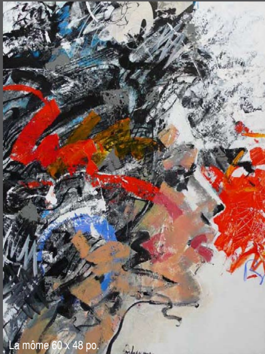
La môme 60 x 48 po.