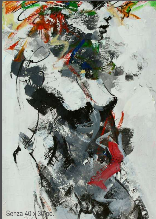
Senza 40 x 30 po.