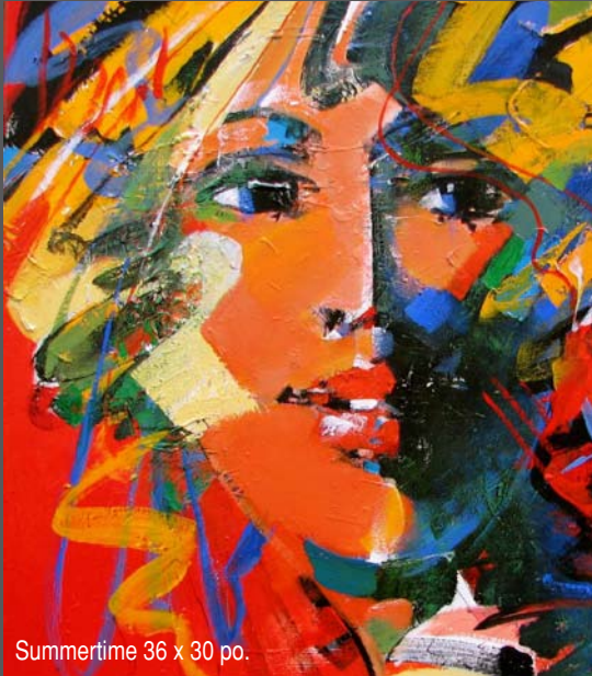
Summertime 36 x 30 po.