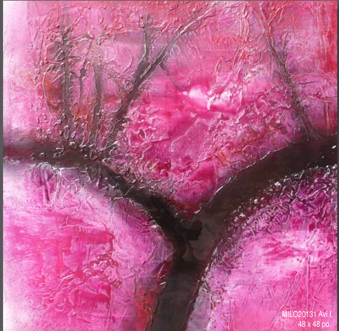
MILO20131 Avi I 48 x 48 po.