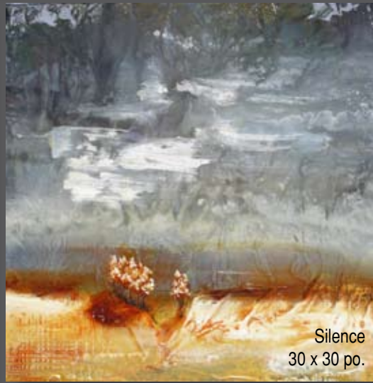
Silence 30 x 30 po.