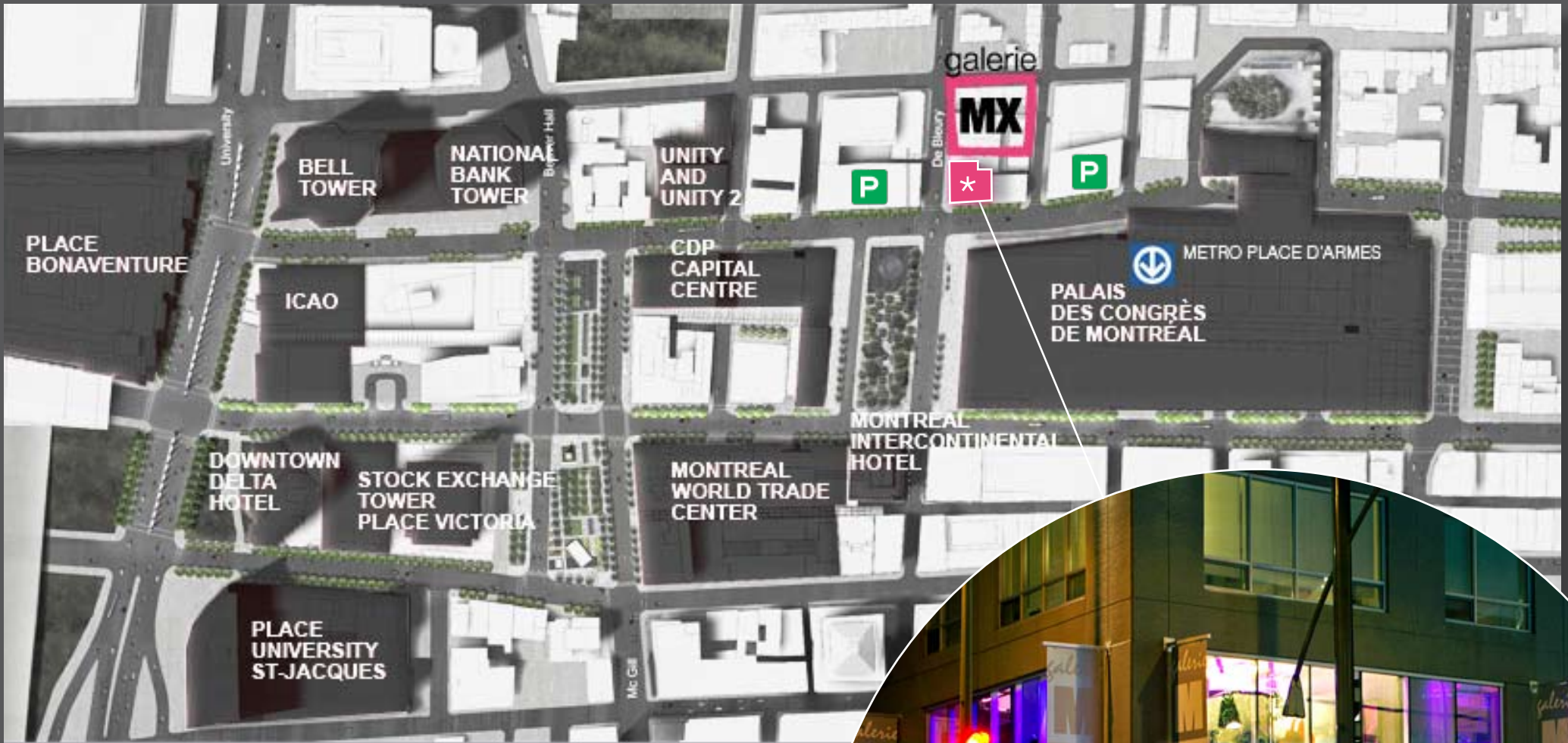
Map Montreal's International District