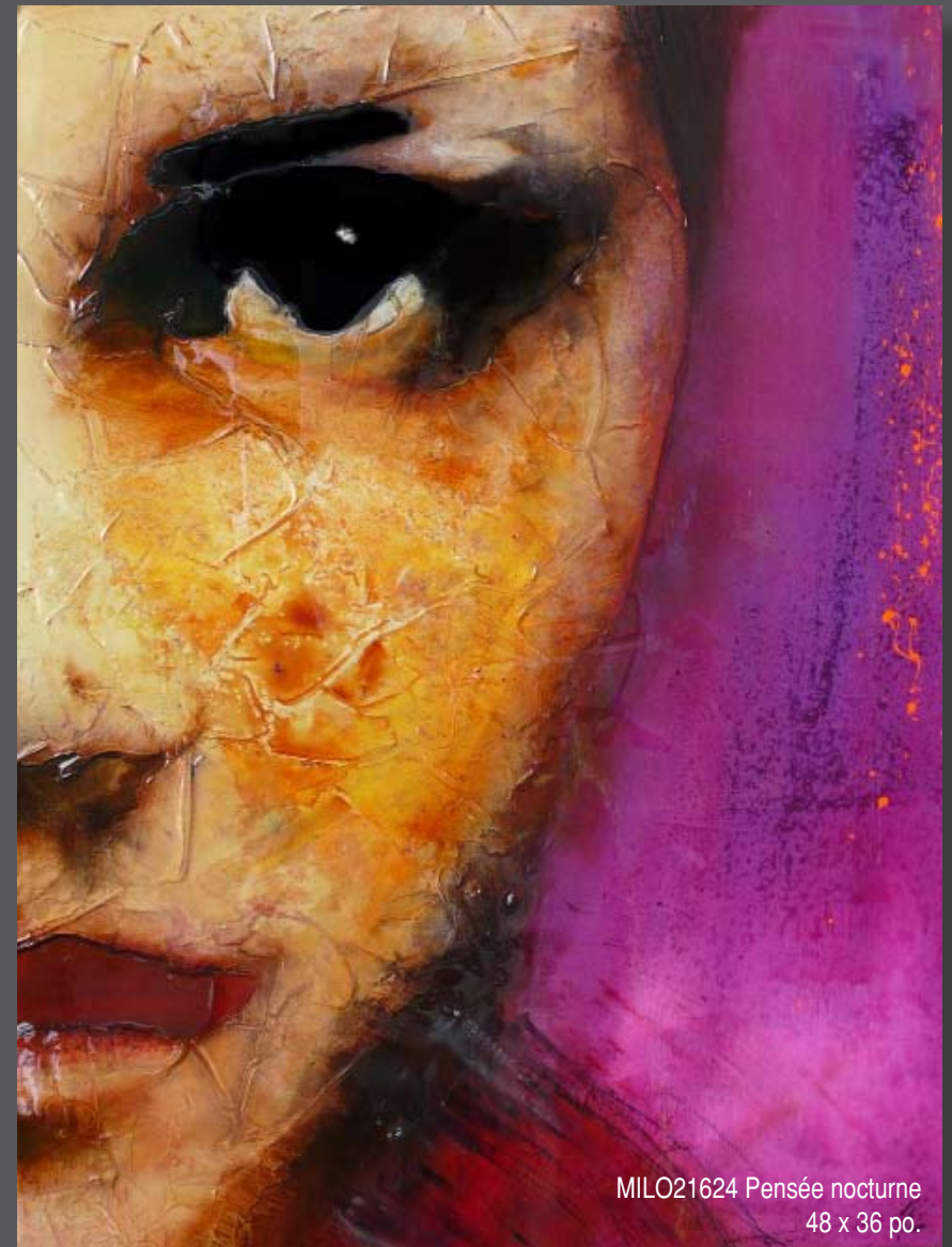
MILO21624 Pensée nocturne 48 x 36 po.