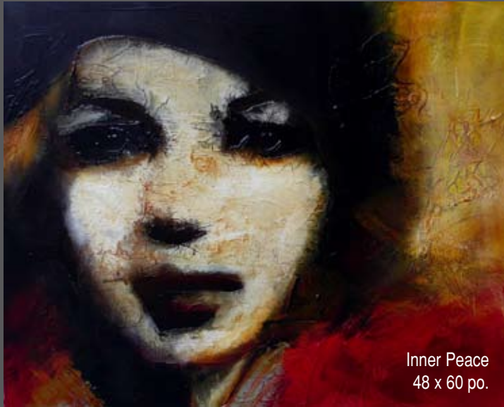
Inner Peace 48 x 60 po.