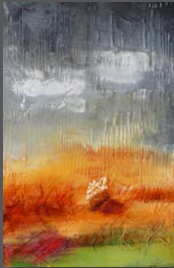
Passion grise 36 x 24 po.